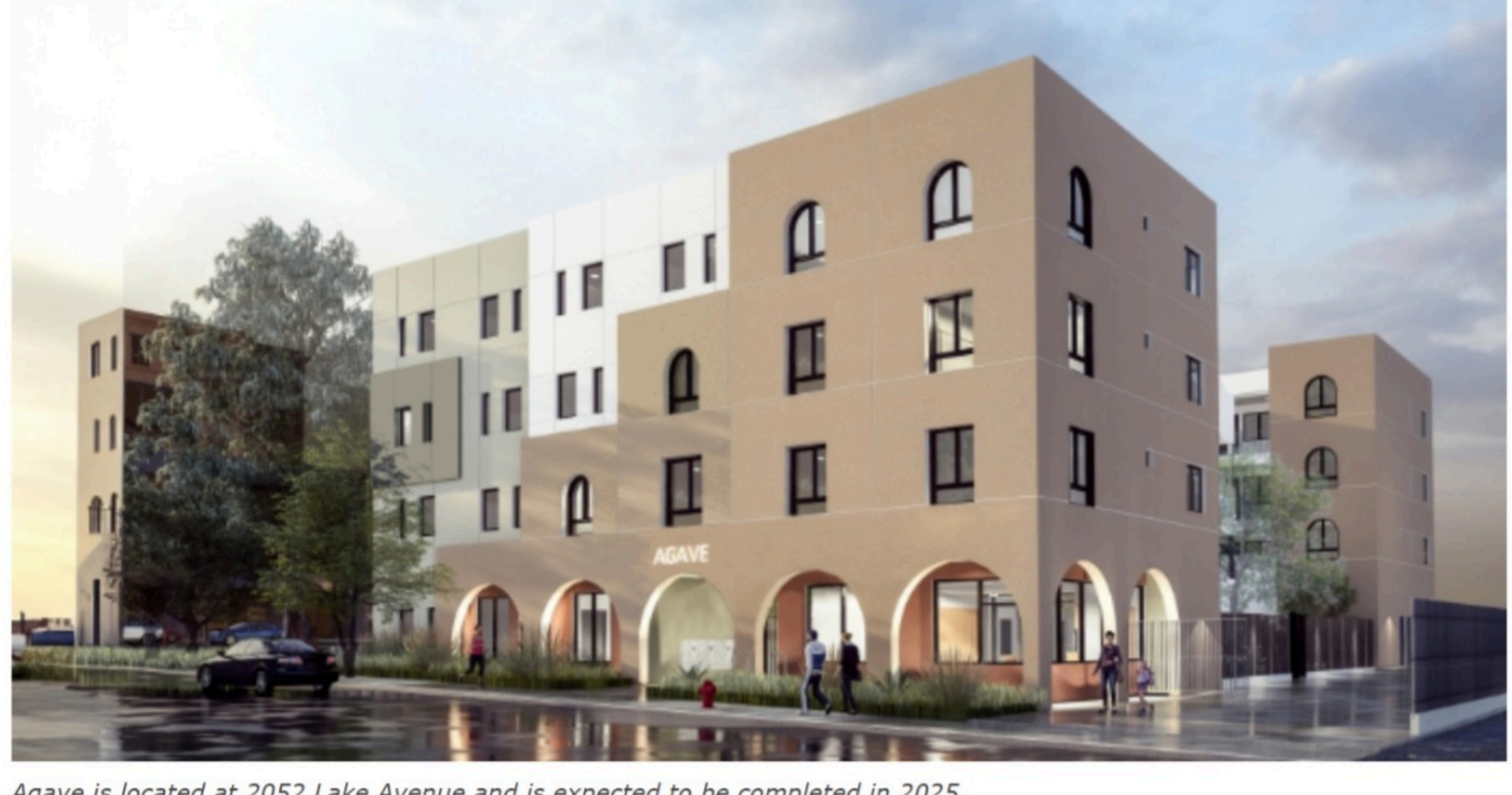
Agave is located at 2052 Lake Avenue and is expected to be completed in 2025.

EAH Housing, one of the largest and most respected nonprofit housing development and management organizations in the western United States, in partnership with Union Station Homeless Services, has started construction on Agave, a 58-unit affordable housing development in Altadena, California.